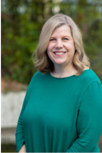
Assistant to the Dean and Office Manager School of Psychology, Family, and Community Hometown: Olympia, Washington